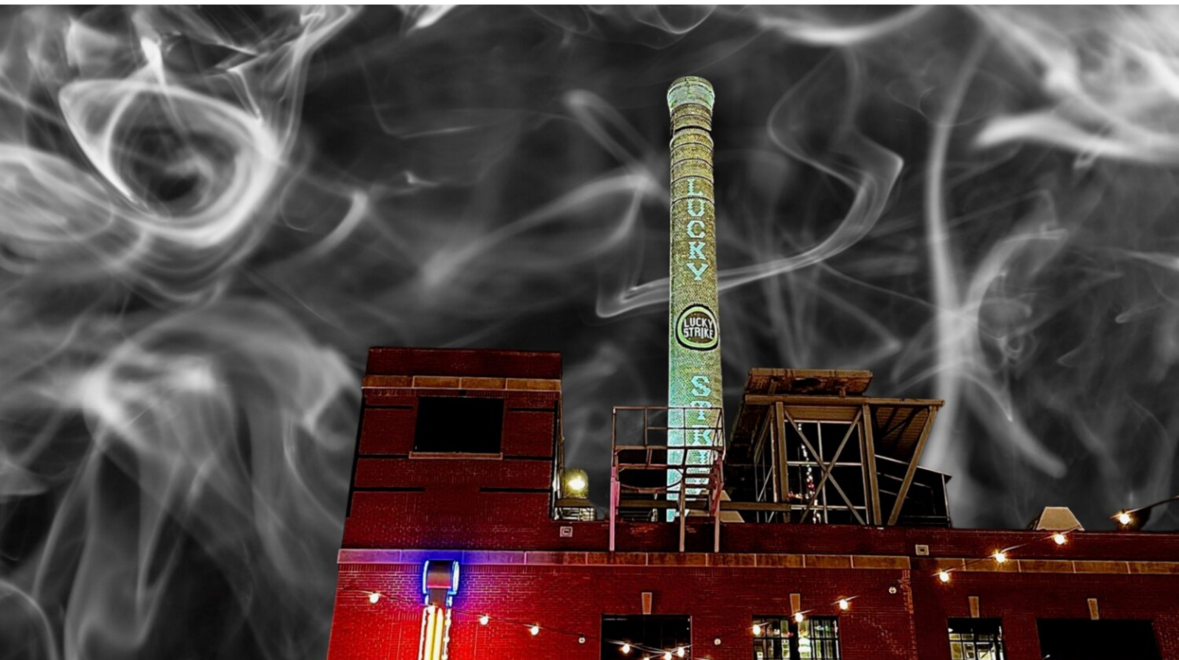
Illustration by Stacy Reece.